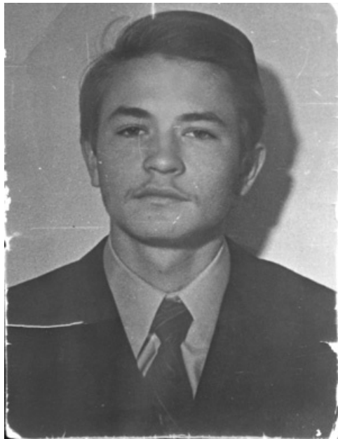
After step 7. Repair places of break.

Step 7: Using "Clone Stamp Tool", "Healing Brush Tool", "Spot Healing Brush Tool" careful and accurately repair places of break.