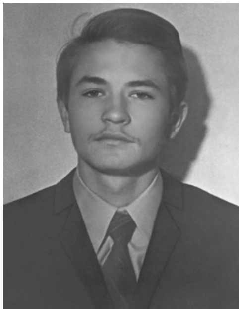
After step 9. Removal of noise and scratches.

Step 9: Using "Clone Stamp Tool", "Healing Brush Tool", "Spot Healing Brush Tool" remove other scratches and spots (and other damages).