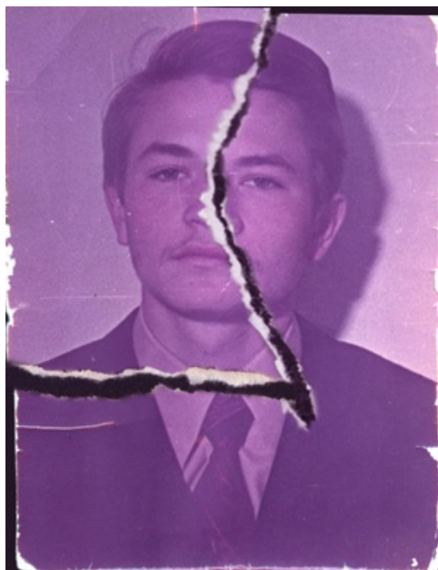
After step 4. Rotated part of photo.

Step 4: Using "Lasso Tool" select parts of a photo and turn them in relation to each other so that as a whole the photo has taken a normal form.