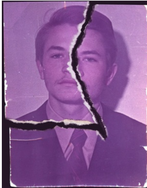
After step 3. Scaned photo.

Step 3: Scan photo in resolution at least 300 dpi, save it as JPEG.